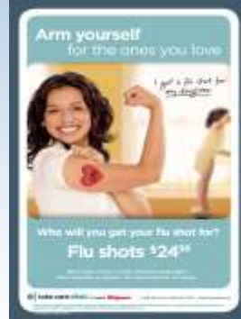
Take Care Clinic